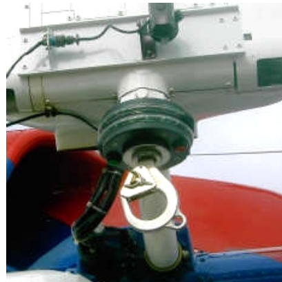
External Hoist Installation