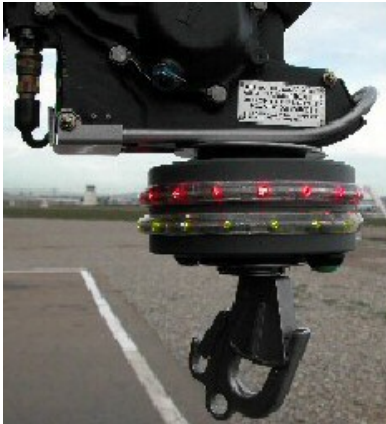
Internal Hoist Installation