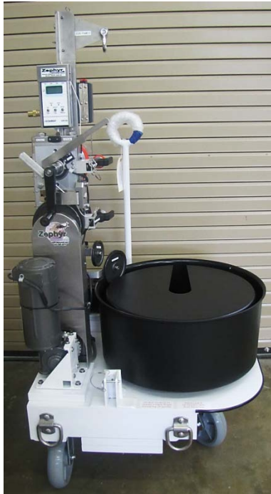
ZGS-11300-1 Mobile Electric RHGSE