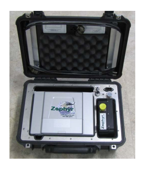
ZGS-15000-3 MagSens TM