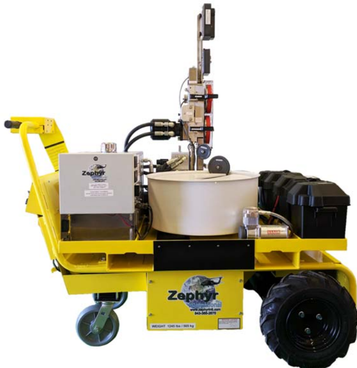
ZGS-10000-8-1 Powered Hydraulic RHGSE