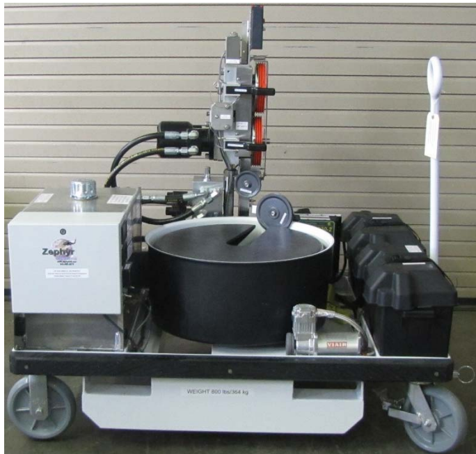
ZGS-10000-5-5 Mobile Hydraulic RHGSE