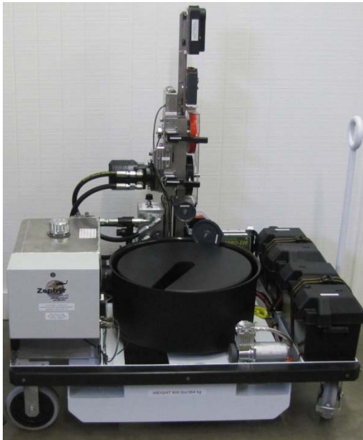
ZGS-10000-5-1 Mobile Hydraulic RHGSE (shown with MagSens Head already installed)