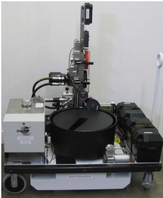
ZGS-10000-5-1 Mobile Hydraulic RHGSE (shown with MagSens Head already installed)